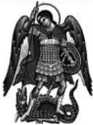
Saint Michael Prayer

Saint Michael the Archangel, defend us in battle, be our defense against the wickedness and snares of the devil. May God rebuke him, we humbly pray; and do thou, O Prince of the heavenly host, by the power of God, thrust into Hell Satan, and the other evil spirits who prowl about the world for the ruin of souls. Amen.