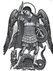
Saint Michael Prayer

Saint Michael the Archangel, defend us in battle, be our defense against the wickedness and snares of the devil. May God rebuke him, we humbly pray; and do thou, O Prince of the heavenly host, by the power of God, thrust into Hell Satan, and the other evil spirits who prowl about the world for the ruin of souls.