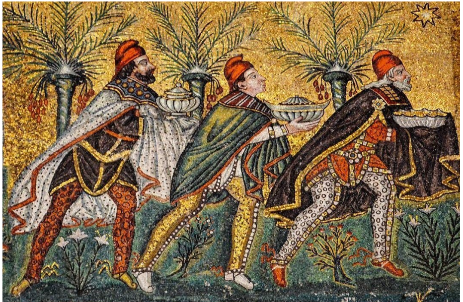
The Adoration of the Magi , c. 504/560 and later. Sant'Apollinare Nuovo, Ravenna.

Epiphany (or Theophany, as it is known in the Eastern Rite Catholic Church), also known as Three Kings' Day, is a Christian feast day that celebrates the revelation of God in his Son as human in Jesus Christ. The word epiphany comes from the Greek word meaning 'manifestation.' The feast also commemorates the visit of the Magi to the Christ child, and thus Jesus' physical manifestation to the Gentiles.