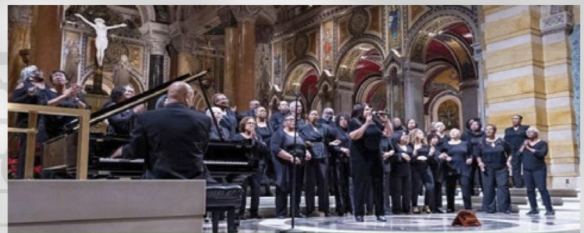
North City Deanery Choir Friday, January 24 , 2020 8 PM

Cathedral Basilica of St. Louis | 4431 Lindell Boulevard St. Louis, MO 63108 | 314-533-7662