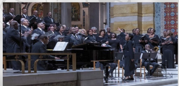
New Sunny Mount Baptist Church Chancel Choir & The Gospel Symphonic Choir Friday, February 7 , 2020 8 PM