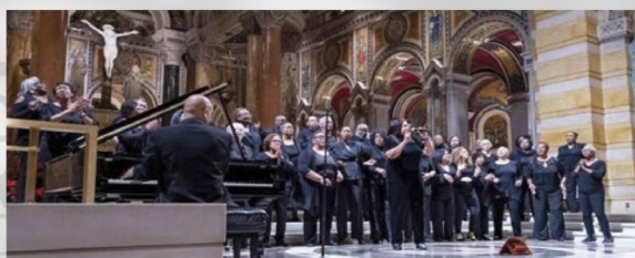
North City Deanery Choir Friday, January 24 , 2020 8 PM

Cathedral Basilica of St. Louis | 4431 Lindell Boulevard St. Louis, MO 63108 | 314-533-7662