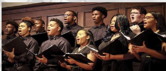
The Sheldon's City of Music All-Star Chorus Friday, January 31 , 2020 8 PM