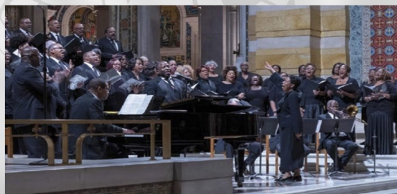
New Sunny Mount Baptist Church Chancel Choir & The Gospel Symphonic Choir Friday, February 7 , 2020 8 PM