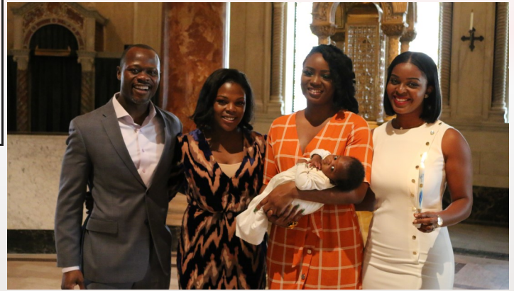
Our Parish Sacramental Life is showing again!

Above: The Faleti family following the baptism of their daughter last weekend.