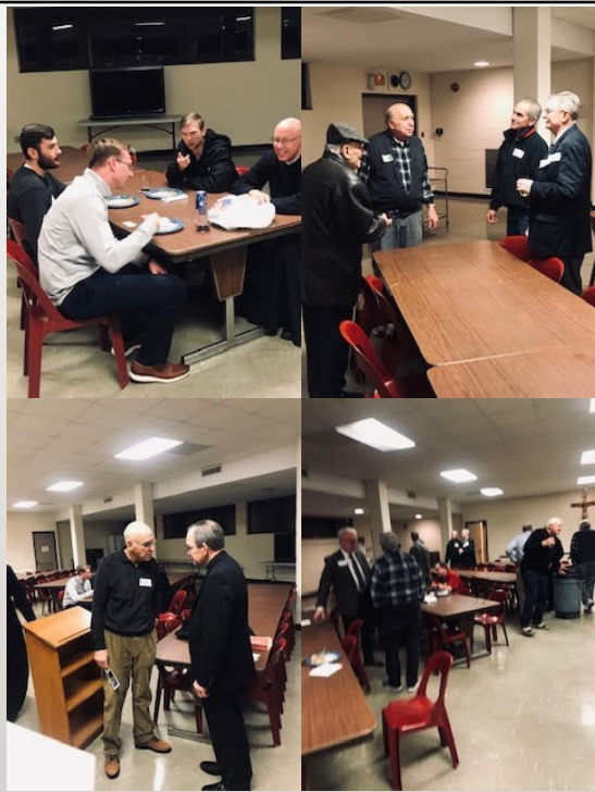
Above: Photos from February's Men of the Cathedral gathering. Watch for info on their next meeting scheduled for March 31!

The Cathedral Parish Coffee and Donuts gathering is held each Sunday in Boland Hall following the 10:00 a.m. Mass. Please join us for refreshments and fellowship today!