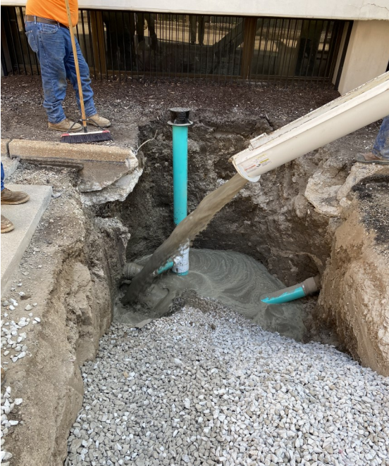
Photo below: Crews replacing damaged sewer lines near Boland Hall.