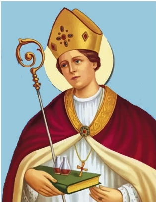
Saint Januarius Patron Saint of Blood Banks