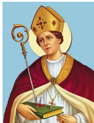
Saint Januarius Patron Saint of Blood Banks