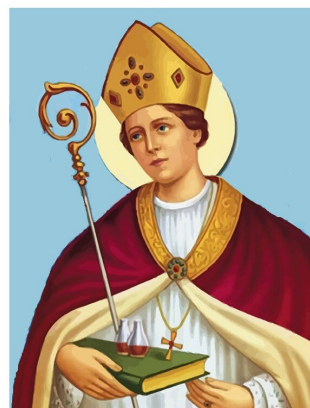
Saint Januarius Patron Saint of Blood Banks

Pauline Books & Media • 9804 Watson Road, St. Louis • 314-965-3512