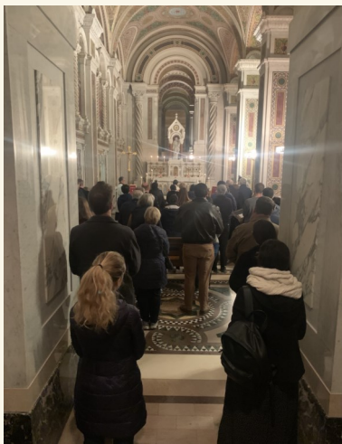
Pictured above - Faithful of the Archdiocese waiting to view the Relic Display, All Saints Day, 2019

On Sunday, November 1 , the Cathedral Basilica will have a collection of more than 140 relics on display in the All Saints Chapel. We encourage all to stop by the Chapel after Mass to view, pray, and find inspiration in these artifacts representative of our faith.